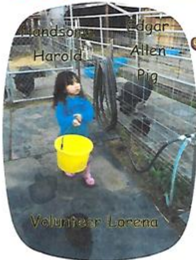
Handson Harold Edgar Allen Pig