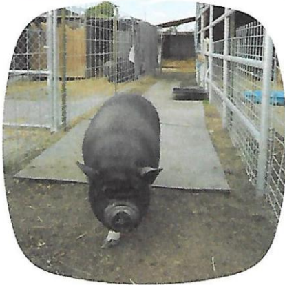
Edgar Allan Pig:

"Did someone say Mom's a comin' with my grub? Where's the beef? LOL."