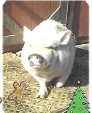
DOTTIE DOODLE BUG