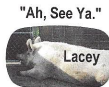
"Ah, See Ya."