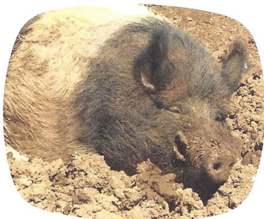
Chopper Baskin' in the Sun!