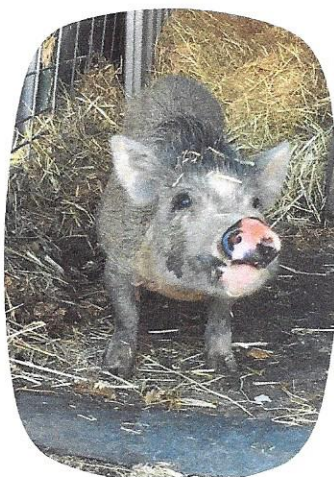
Fawney Beggin' for a Cookie.