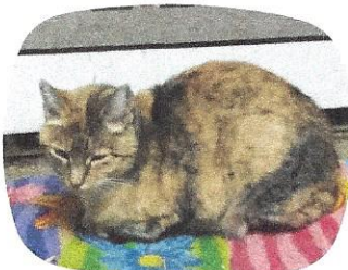
Persey Kitty Holdin' Down the Fort.