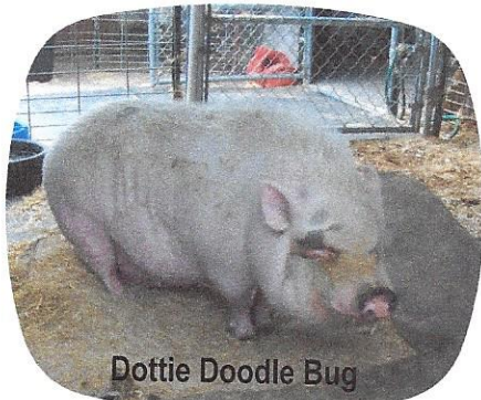
Dottie Doodle Bug