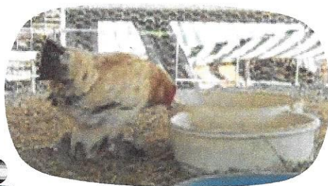
Me-Me Miracle Hen (15 Years)