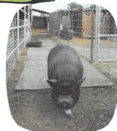
Edgar Alan Pig