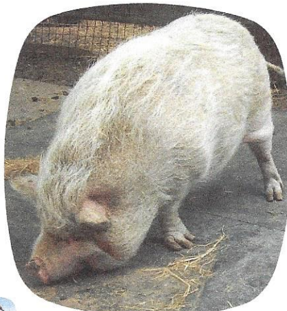
Maggie-Mae, The New and Improved Beach Body Pig, Woo Hoo.