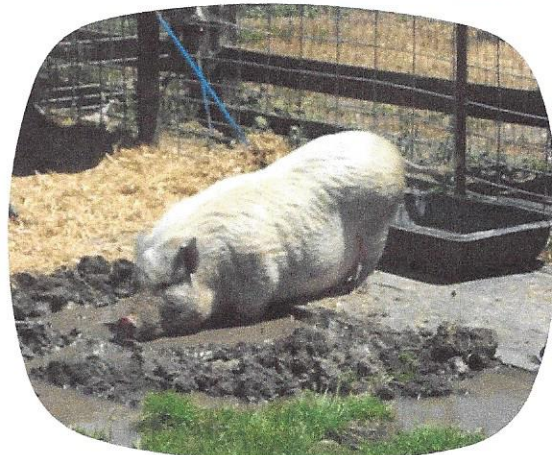
Missy Piggy Picture Worth a 1,000 Words.