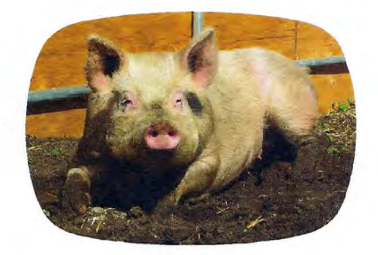
Lacey: "Hammy... how do you stay so clean little man?"