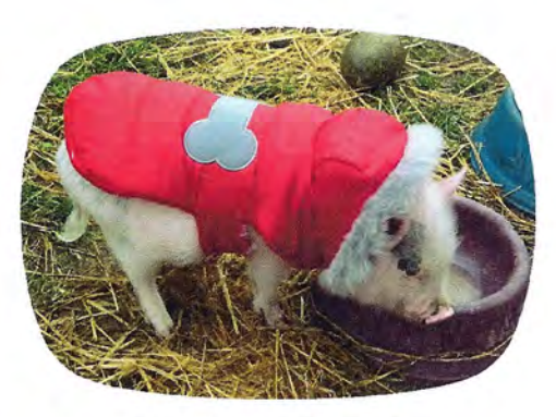
Hamekins aka Ham Ham: "O.M.Gosh... I can't believe I ate the whole thing... I don't feel so good?"

Gordon aka Gordy A Boar No More... "Mighty fine life I have now..." Thanks to the people who helped pay for my surgery, shots, etc., through the Fundrazr' Site."