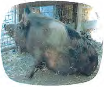
Savanah: Waitin for Treats.

Juice Plus+ Whole Food Supplement Kirkland Fish Oil 1,200 MSM and Cetyl M Supplements Dried Prunes and Dried Apricots, No Sulfur Avon Skin So Soft Lotion and Oil Postage Stamps