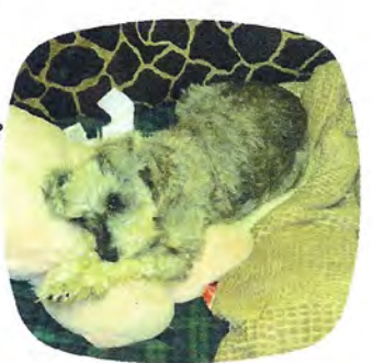
Casey Pup: "Sometimes life is just plain EXHAUSTING ... sigh???"