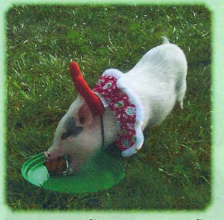
Step 2 - Identify the Pie Step 3 - Pick up the Pie