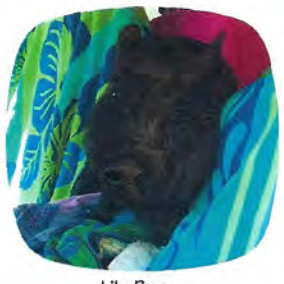
Lily Bug: HEY ... are we there yet