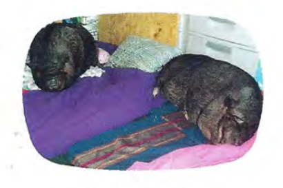
Peanut & Jasmine at Cuddly Critters... visiting.