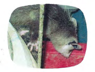
Oppie: One of our two little teenage Possum who came for Nellie's cat food each night.