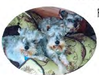
Casey, Miles, Patty Jo

Juice Plus+ Whole Food Supplement Kirkland Fish Oil 1,200 MSM and Cetyl M Supplements Dried Prunes and Dried Apricots, No Sulfur Avon Skin So Soft Lotion and Oil Postage Stamps